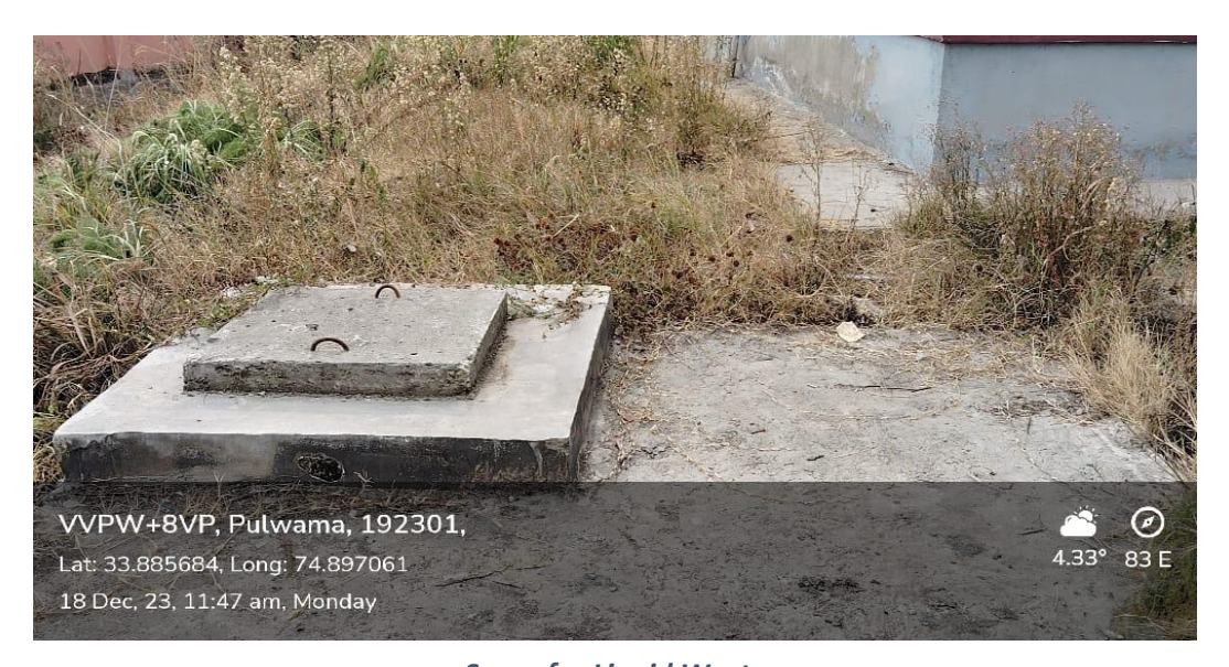
Sump for Liquid Waste