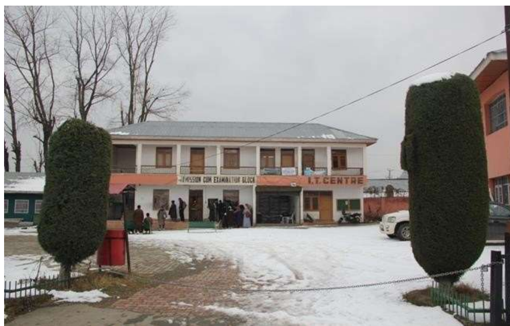
College Admission Cell/ IT Centre